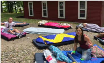
Cabin1 takes nap time outside #paperhogs #danicasaidno