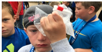
Epic Nerf war by @CabinB isn't without it casualties #warisheck #purpleheart #brooks